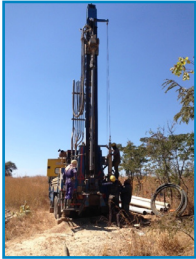
Successful Borehole Drilling

Much progress is being made in the construction projects.