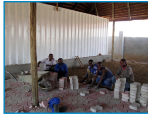
The Crew Laying Pavers

We praise the Lord that on August 4, water was found at the Chisamba campus. The company that drilled the bore hole planned to only go down 65 metres, but did not find water at that depth. The decision was made to keep drilling and water was found at about 90 metres.